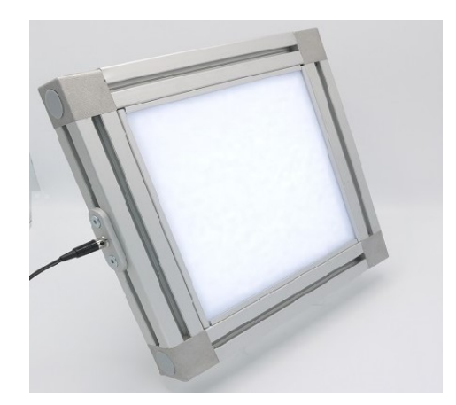
Figure 1. Back Light K3232